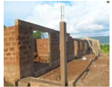
September 2011: We are up to the roof!!