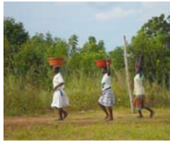
June 2011: Women bring water to help mix the cement