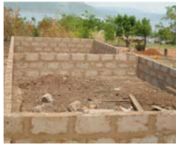
March 2011: Progress with the foundations