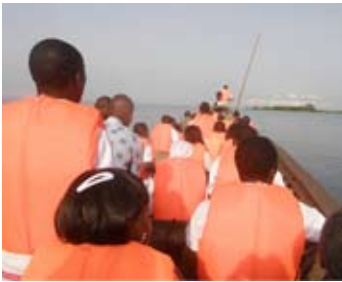
January 2011: Workers make the trip to the Island to start work on the school

Please visit the website to see more pictures.