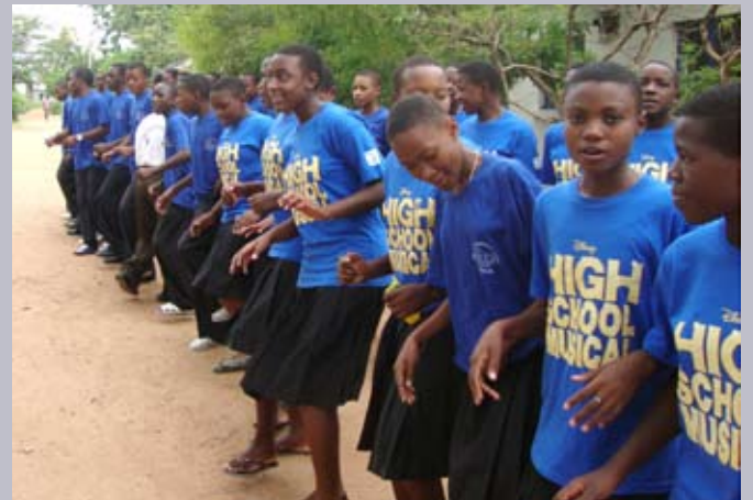
This is the local church choir – dressed up in some of the contents of the container.

The trustees went from the Southern Highlands to the hot and arid conditions of the Shinyanga region. The main projects in this region involve a large secondary school and a local clinic run by sisters. The five